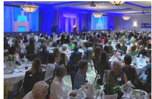
The Hilton Melbourne Rialto Place ballroom was maxed out both days