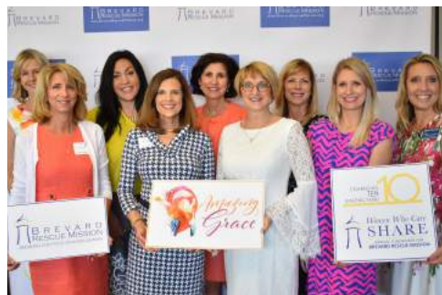
The Incredible "Women Who Care Share" Planning Committee Members