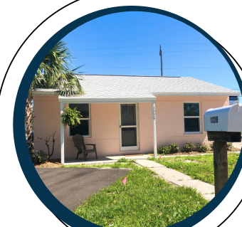
The Cottages 8 graduate families in individual cottages