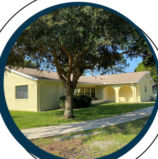
New Life Village 15-18 families in group-style living

Through education, accountability and goal advancement, our program empowers families to become self-sufficient and break the cycle of homelessness.