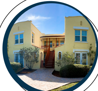
Casa Carol 8 families in individual apartment units