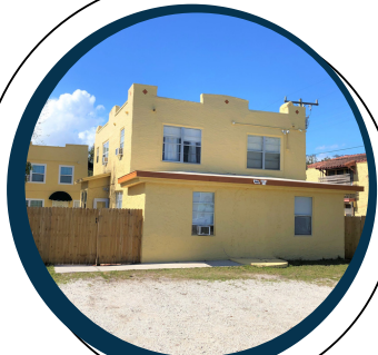
Joy's Place 5 families in individual apartment units